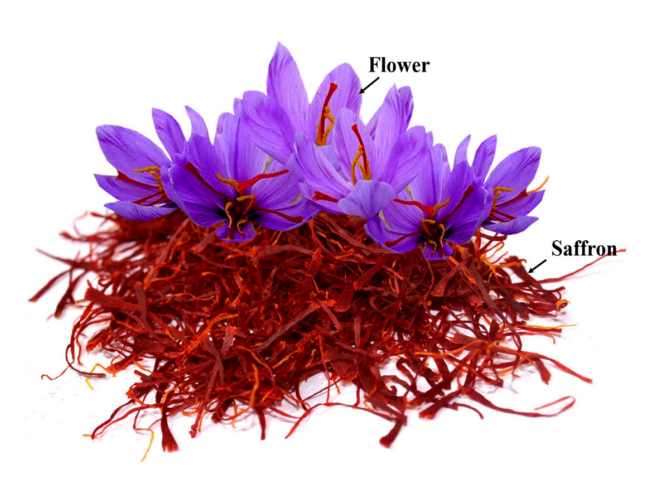
Figure 1. Illustration flower and stigmas of saffron ( Crocus sativus L .).

Crocus sativus L. or saffron is known as Crocoideae - subfamily of Iridaceae family (i.e.: rich in endemic