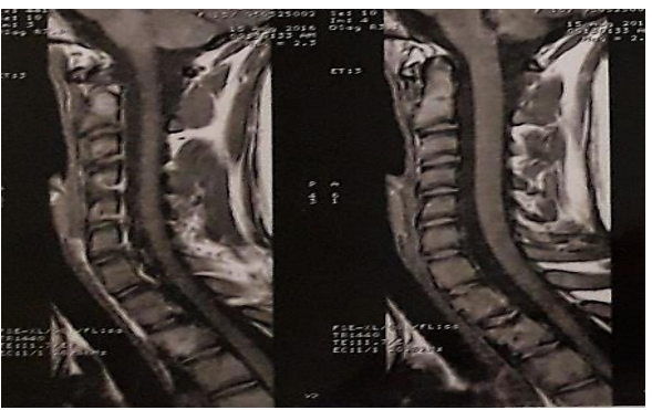
Figure 1. Cervical magnetic resonance imaging (MRI)

In neurology ward, brain magnetic resonance imaging (MRI) was done, and that was normal. Electroencephalography (EEG) had done, and the conclusion was some paroxysm of disorganization without significant epileptiform discharge (Figures 1 and 2).