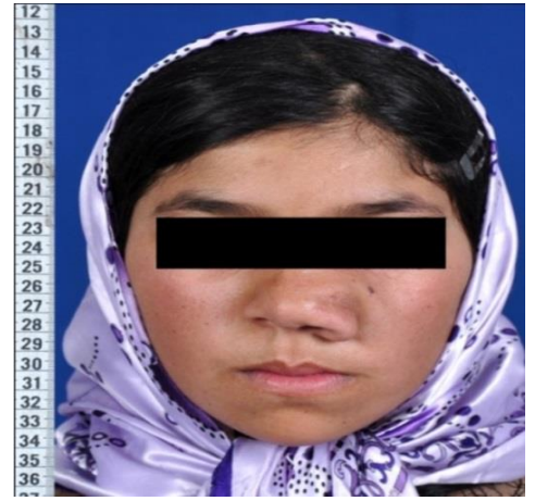
Figure 1. Photograph of the patient before surgery (notice the left external nasal mass)

Patient was a 15 year old girl with left-sided nasal and malar mass, which had developed during a 10 year period. Patient did not complain of face or nose pain, headache, epistaxis, nasal discharge, or adenoid. She mentioned a history of a blunt trauma to nose which had not been followed-up. Patient had no history of systemic diseases in the past. In physical examination, a subcutaneous mass was observed in left lateral side of the nose leading to elephantiasis of left side of the nose. The mass had spread towards the face medially and had also caused deformity in the face. There was alar cartilage, nostril and left nasolabial chin downward dislocation. While touching, there was a mass with approximate size of 7 × 5 cm, with non-circumscribed, soft and non-tender consistency on left side of the nose and subcutaneous tissue. Skin on mass seemed unfiltered and thick but lacked any wound and superficial lesion. Mass had no adhesion the underlying tissue. In intranasal examination, there was no symptom of wound, mass or mucosal lesion. Eye examination was normal. There was no lymphadenopathy in the neck. Neurologic examination of the patient was normal. There was no pigmentation and mass on the skin of other parts of the body (Figure 1).